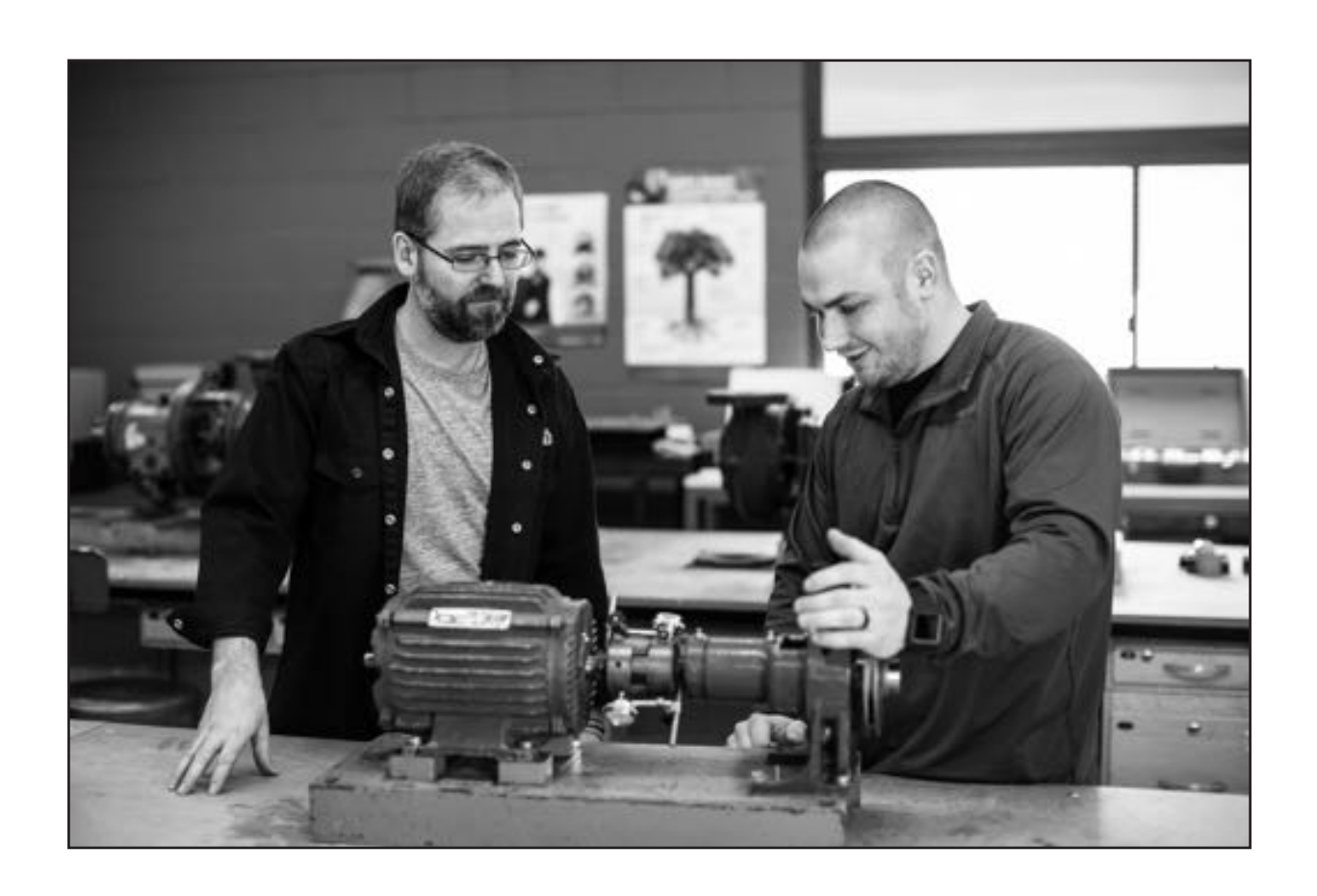
Total for Certificate = 36